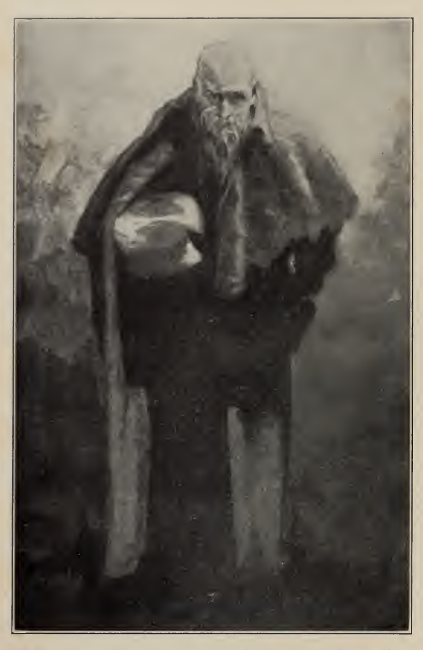
A large-framed man, with snow-white hair cut close to his skull, French fashion.